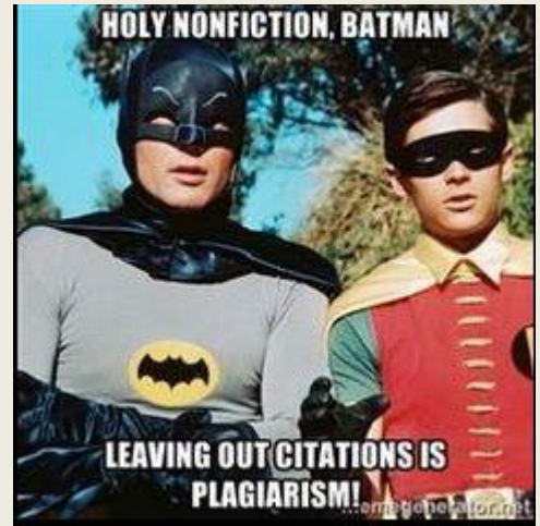
Meme created by MSU WC staff and distributed via Twitter (@MSU_WC) during Spring 2015.