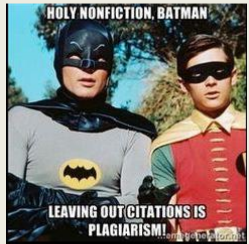
Meme created by MSU WC staff and distributed via Twitter (@MSU_WC) during Spring 2015.