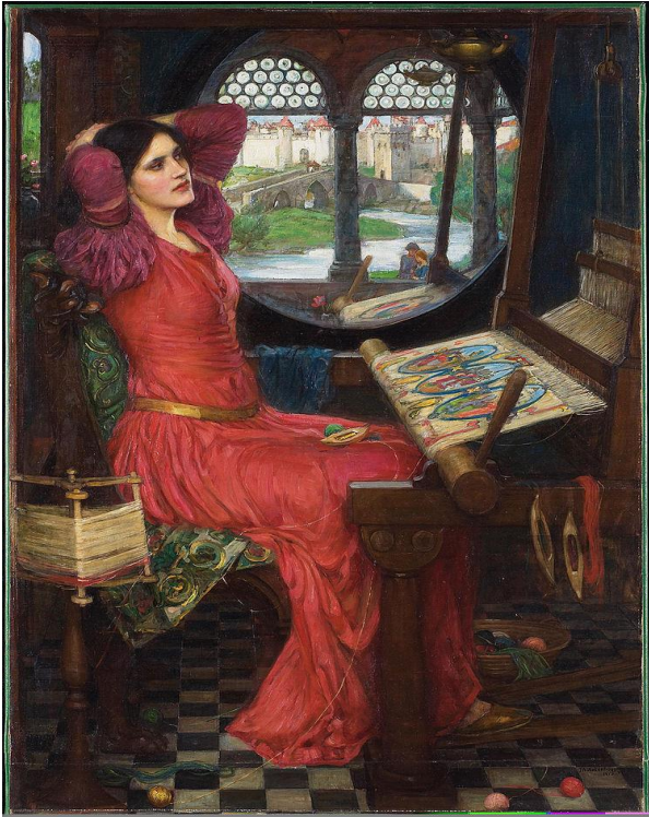
Lady of Shalott: “Victorian poetry beats a boat ride!”